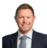
Jamie Greene Scottish Conservative and Unionist Party