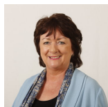
Rona Mackay Scottish National Party