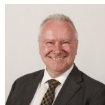
Alex Neil Scottish National Party